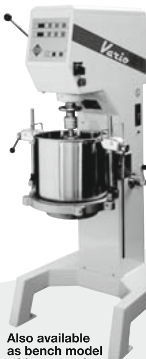
REGO VARIO Beater and mixer 32/40 liter