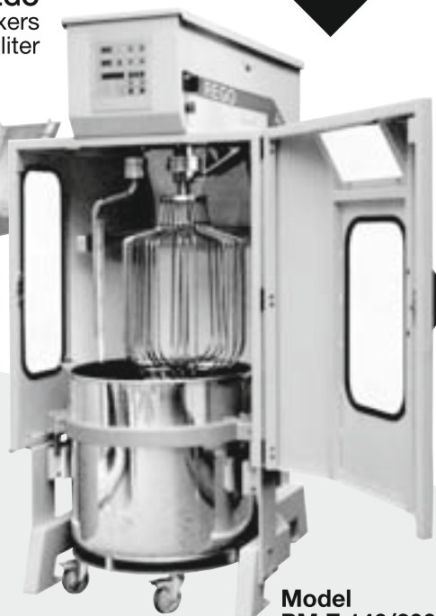
Model PM E 140/200

Also available as bench model with a capacity of 10-60 liter