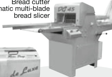
ROTO SHOP de Luxe Bread cutter fully automatic