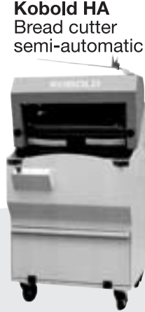
Kobold HA Bread cutter semi-automatic

Available in stainless steel as well as for self-service operation