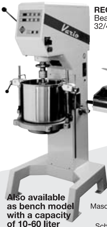
REGO VARIO Beater and mixer 32/40 liter

With us, bakeries all over the world can work quicker, better, more efficient!