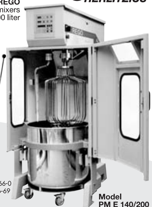
Model PM E 140/200