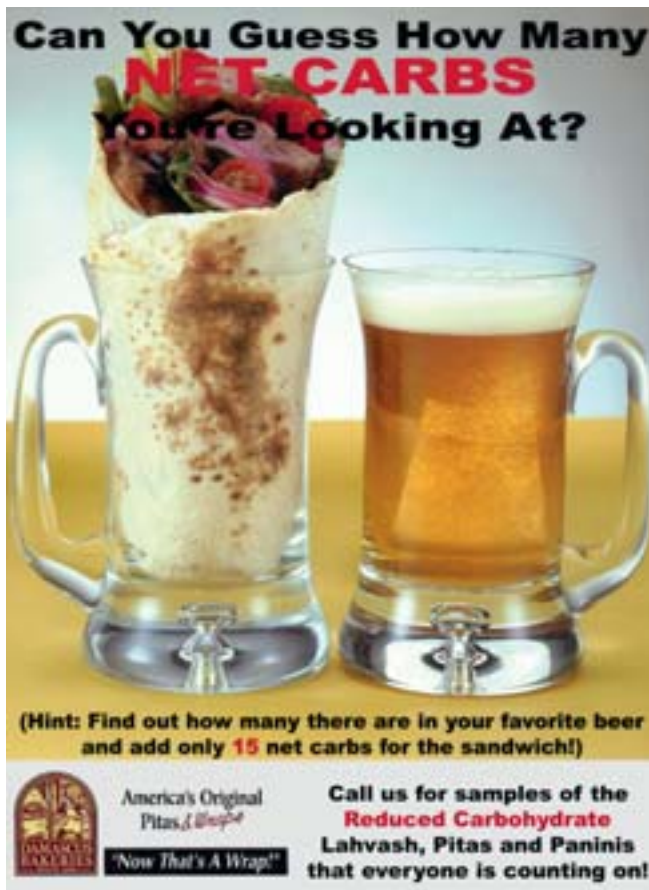
++ figures 4 + 5 + 6 Damascus Bakeries shows in its advertising leaflets the variations available with flat bread: filled pita, pizza topping and others

When cooled down the wrap become flexible again. This bread originated in the Eastern Mediterranean region and is today one of the most important types of bread in the Middle and Far East as well as in the South-East Republics of the former Soviet Union. It is similar to the popular Turkish Dürüm. Damascus Bakeries produces lahvash as round wraps or in a square shape as a roll-up. The varieties include a whole meal multi grain wrap and a flax roll-up and many more differently flavored products. Par-baked flat bread is also sold as pizza crust. It needs only to be topped and heated. Another product is the so-called cracker bread which is par-baked flat bread slices that just have to be heated and dried in the household's oven.