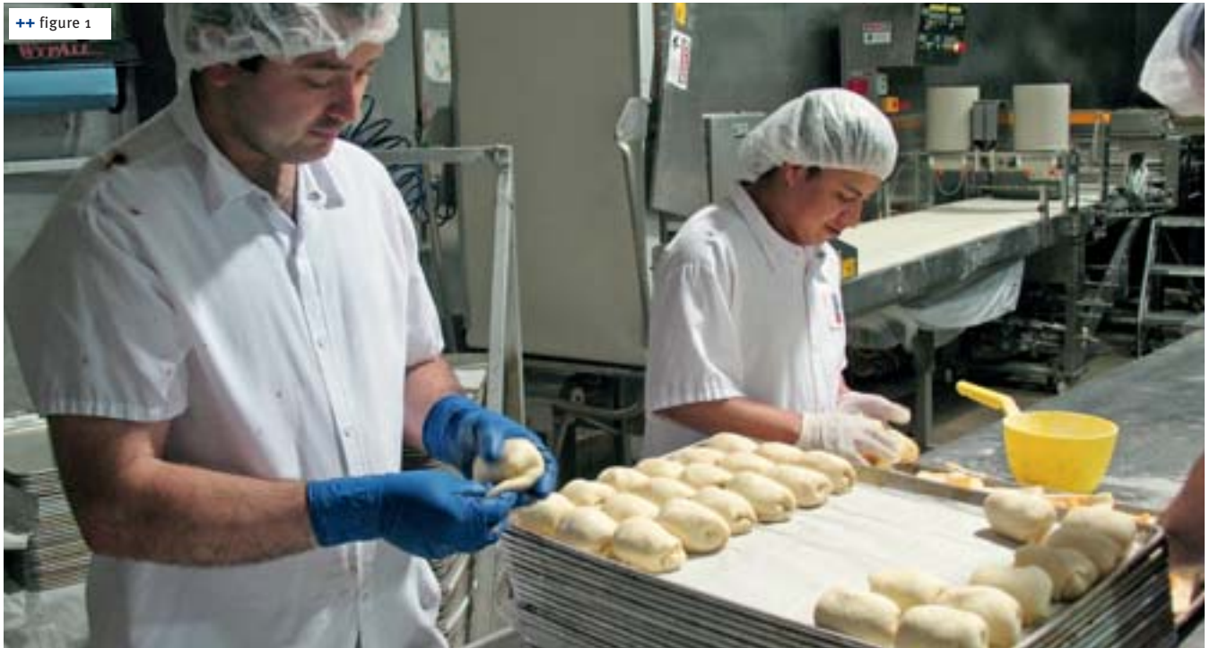
++ figure 1 One of the very few sweet products made by Tom Cat: Apple turnover

CHEFS IN NEW YORK ARE A BREED UNTO THEMSELVES. THEY ARE ACCLAIMED CELEBRITIES, HIGHLY DEMANDING AND CAPRICIOUS. IN 1987, ONE OF THEM FOUNDED TOM CAT, A BAKERY SPECIALIZING IN SUPPLYING RESTAURANTS, HOTELS AND CATERING COMPANIES. THIS BAKERY IS ALSO CONSIDERED TO BE A BENCHMARK FOR THE COMPETITION