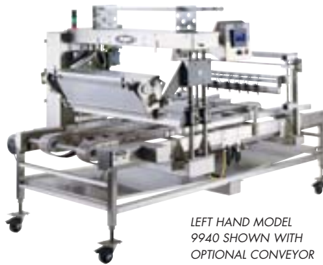
LEFT HAND MODEL 9940 SHOWN WITH OPTIONAL CONVEYOR

Designed for accurate topping coverage and seed savings by automating the setup process from operator to operator.