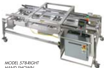
MODEL 578-RIGHT HAND SHOWN

Decreases cripples with the circular motion of the Burford Orbital Pan Shaker