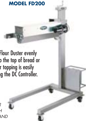
FLOUR DUSTER SHOWN WITH OPTIONAL STAND

The Burford® Flour Duster evenly applies flour to the top of bread or buns. The flour topping is easily controlled using the DC Controller.